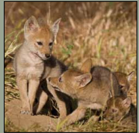
Coyote pups seen at the La Burrenca Unit of the SRNWR, a site restored by River Partners.