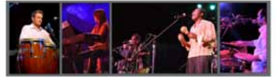
Afro-Cuban Salsa & Latin Groove