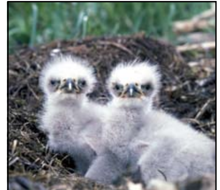
Bald eagle chicks.