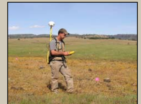
Tehama Environmental Services, Inc., conducting a wetlands delineation survey on the Bidwell Ranch property.

During the meeting, several people joined the Citizen's Work Group—a team