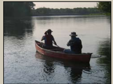
Sacramento River.

Check back at www.RiverPartners.org for more information or call (530) 894-5401 x 22. If you'd like to receive alerts by email, sign up at our website's home page under eNewsletter.