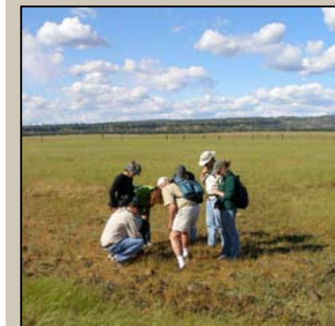
Members of the Citizen Work Group tour the site.