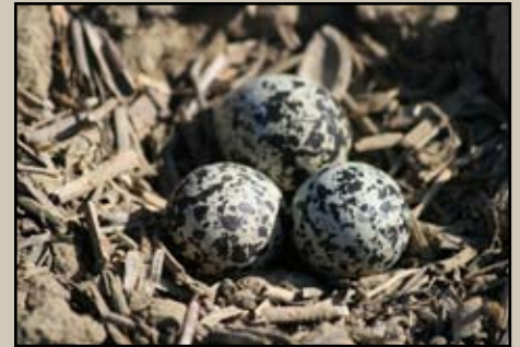
Killdeer nest on a River Partners restoration site.

New San Joaquin Valley Regional Director