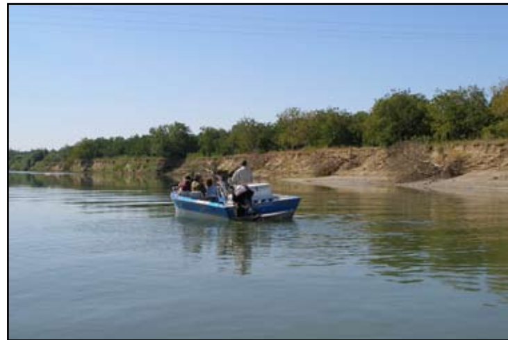
River frontage of the Gaines property. River Partners will convert the walnut orchard into riparian habitat.

Due to its location at another major river crossing, River Partners felt the Gaines property offered another public lands opportunity, especially for boating